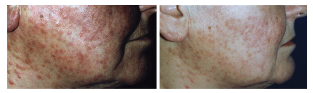
Figure 2. Facial skin lesions in patient with mastocytosis. Facial skin was examined and photographed before treatment with imatinib (left panel) and one year after therapy with imatinib (right panel). The loading dose of imatinib (5 months) was 400 mg/day, and maintenance dose 200 mg/day.