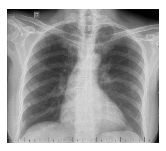
Figure 1. Chest x-ray anterior image, UFU Medical School Clinics Hospital, Brazil, 2021.