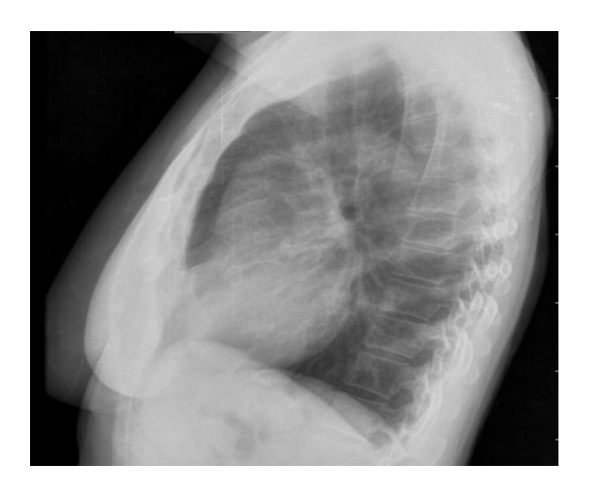
Figure 2. Chest x-ray image in profile, UFU Medical School Clinics Hospital, Brazil, 2021.

submitted to transesophageal echocardiography, which identified a peduncular mass in the basal septum, with irregular edges, and dimensions 4.9 \text{ cm} \times 2.9 \text{ cm} in the left atrium.