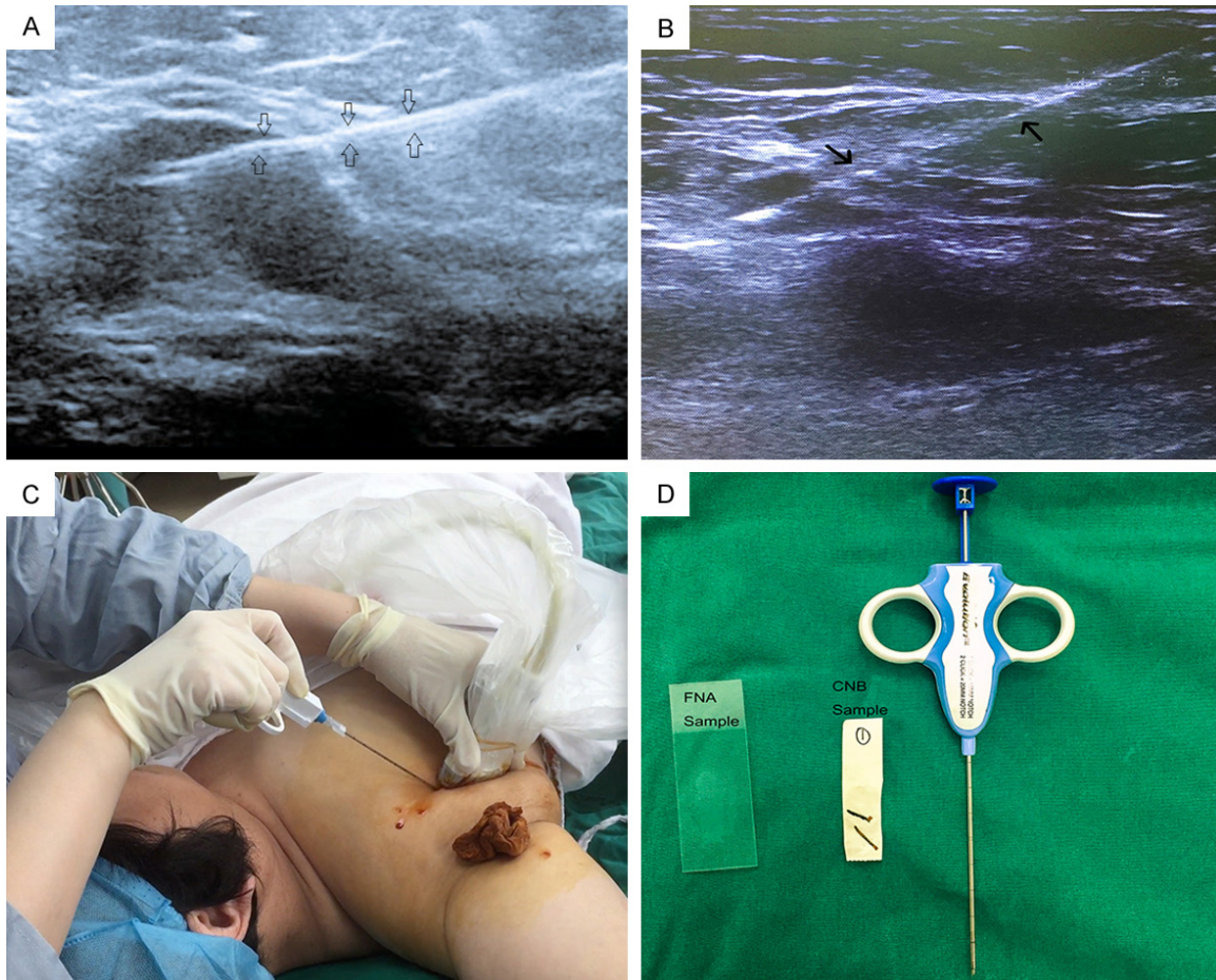
Figure 3. A. The ultrasound-guided FNA shows open specimen collection trough of the suspicious Sentinel Lymph Node (SLN). (Arrows indicating FNA needle). B. The ultrasonography-guided CNB shows open specimen collection trough of the suspicious Sentinel Lymph Node (SLN). (Arrows indicating Core Needle Biopsy needle). C. Ultrasound-guided freehand technique to extract sentinel lymph node biopsy. D. FNA and CNB specimens' samples of Sentinel Lymph Node (SLN) (Black stained).

sidered efficacious for lymphoscintigraphy, but the perfect radioisotope tracer for SLN visualization is pellucidly different from a particulate tracer optimized for the visualization of all the lymph nodes by measures of scintigraphy [32-34]. Whereas the large radioisotope particle tracers, appears to pass across to secondary nodes barely, nevertheless, they show less uptake at the injection site.