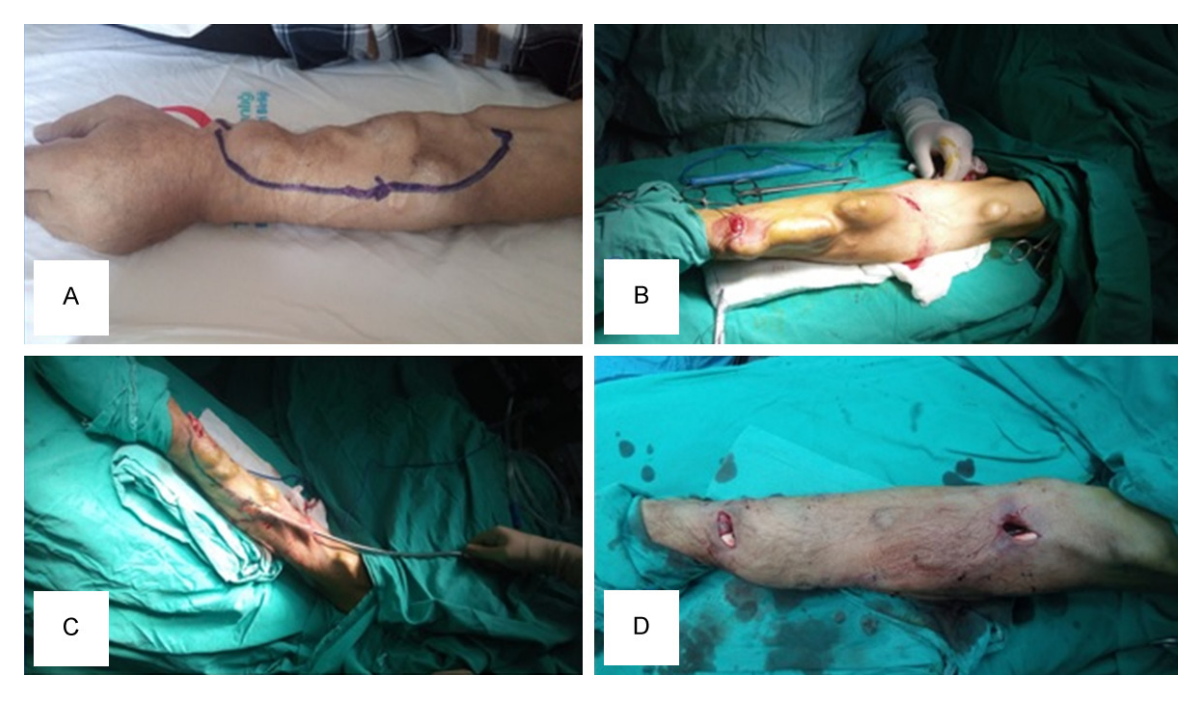
Figure 1. A. Surgical planning with the aid of preoperative US. B. Minimal surgical incisions for AVF reconstruction. C. Creating subcutaneous tunnels for the PTFE graft. D. Completed anastomoses after the PTFE graft being passed under the skin.

HT, Hypertension; DM, Diabetes mellitus; *Chi-Square, #ANOVA (Tukey HSD: P = 0.158).