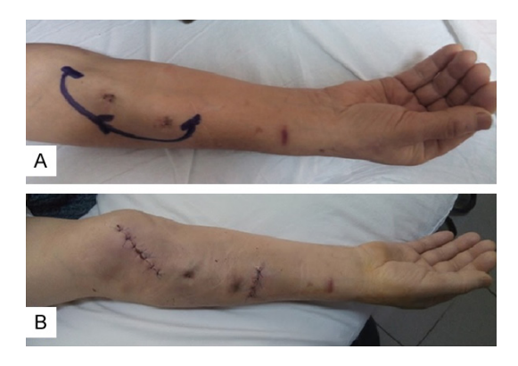
Figure 2. A. Preoperative US mapping of AVF stenosis due to repeated dialysis needle insertion attempts. B. Placement of a PTFE interposition graft following excision of the stenotic segment of the AVF after surgical procedure.