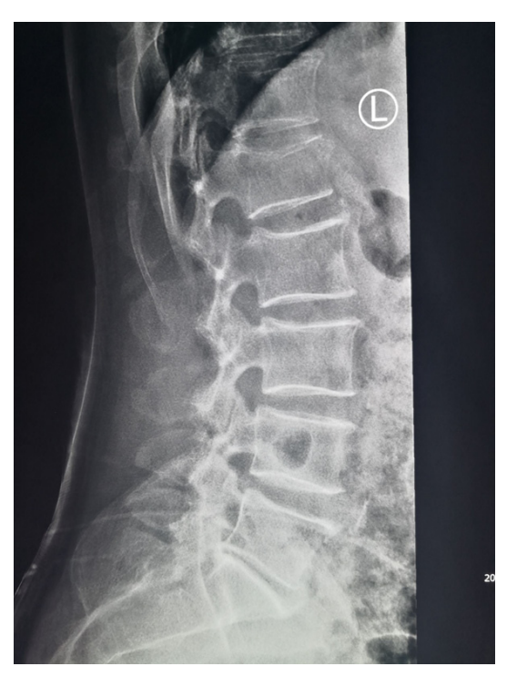
Figure 3. The anterior vertebral compression after 3 weeks of treatment. After three weeks of treatment, the anterior centrum compression was reduced to 15% along with a reduced Cobb angle of 11 degrees. These values confirmed the excellent effect of the combined therapy in fractures.

x-ray examination showed that her vertebral compression and Cobb angles were reduced after 3 weeks of treatment compared with her condition at admission, as shown in Figures 2 and 3 .