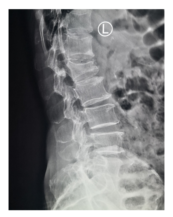
Figure 2. Anterior vertebral compression. A 47% compressed anterior centrum with a Cobb angle of 18 degrees was recorded at admission.