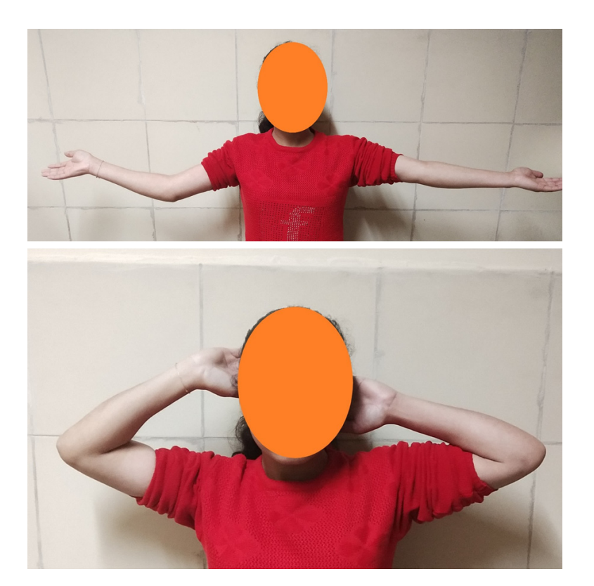
Figure 4. Case 6-clinical photo at the final follow-up showing terminal loss of flexion and extension of the elbow.

ment in such fractures is the bony fragment between the proximal part of the olecranon and the tip of the coronoid, which must be meticulously reduced in order to restore the appropriate length. Normally proximal ulna has a physiologic apex dorsal bow that has been named "proximal ulna dorsal angulation" (PUDA). Restoration of this angle is very important during the fixation of proximal ulna fractures. In the literature, the mean PUDA was found to be 5.7^{\circ} , 6.2^{\circ} \pm 2.7^{\circ} (range 1^{\circ} + 11.2^{\circ} ) and 8.49^{\circ} \pm 2.69^{\circ} (range 1.70^{\circ} + 14.1^{\circ} ) in dif-