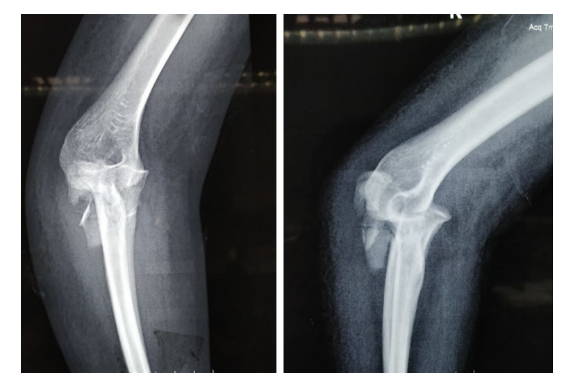
Figure 1. Case 6-anteroposterior and lateral radiograph of the elbow showing tansolecranon fracture dislocation.

December 2020. All patients presenting with a transolecranon fracture-dislocation of the elbow, which were managed by Kirschner wires (K-wire) fixation and Cerclage wiring technique, were considered for inclusion. After the local and neurovascular examination, anteroposterior (AP) and lateral radiographs of the elbow were performed and were reviewed. The diagnosis of such fracture was made when an olecranon fracture was associated with the anterior translation of the forearm in relation to the distal humerus on the lateral radiograph and intact proximal radioulnar joint on the anteroposterior and lateral view (Figure 1). The details of the patients are summarized in Table 2. All the patients were operated on under general anesthesia and by a single surgeon.