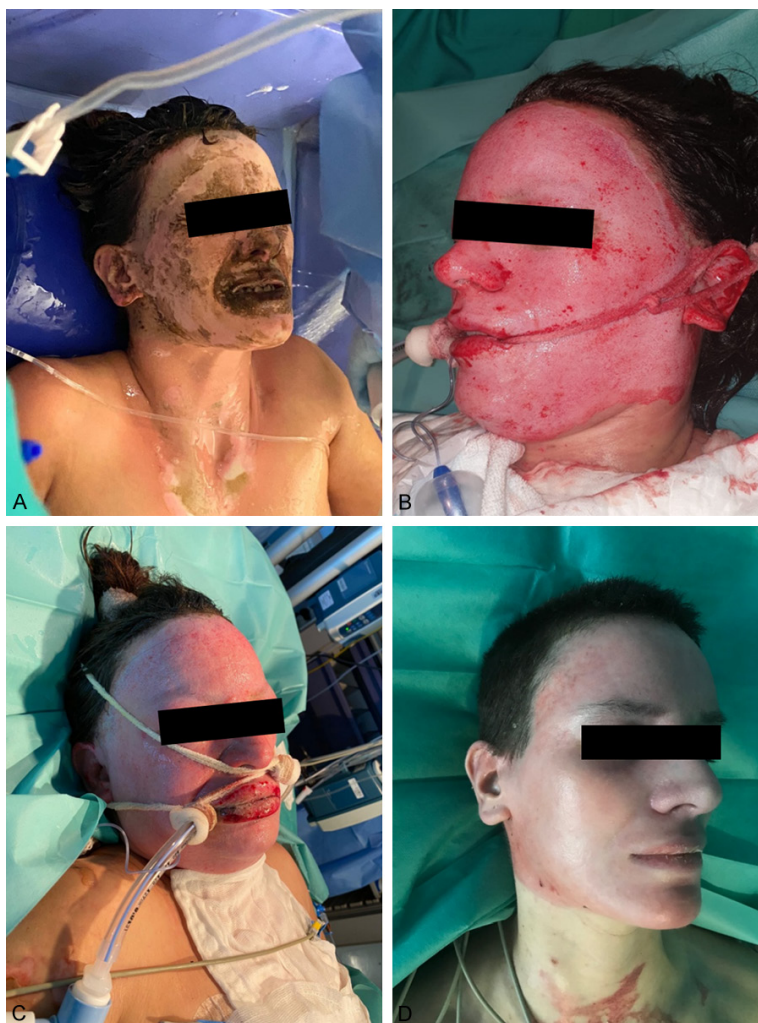
Figure 4. Deep burns in facial area treated with enzymatic debridement and posterior application of Medihoney®. Complete healing was achieved without need of surgery, with a good cosmetic result. A. Pictures taken in the emergency room. B. Just after removing the enzymatic product (it was maintained for 4 hours). C. 24 hours after ED. D. Day 30, complete epithelialization, good cosmetic result.

Center, Vall d'Hebron Hospital Universitari, Vall d'Hebron Barcelona Hospital Campus, Passeig Vall d'Hebron 119-129, Barcelona 08035, Spain. Tel: +34-934893474; ORCID: https://orcid.org/0000-0003-3709-0436 ; E-mail: jonanderagirrez@gmail.com