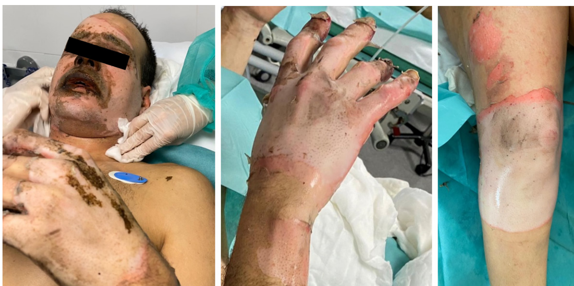
Figure 2. Most burns were intermediate-deep second and third degree burns and were located in face and upper and lower limbs.

M: Male; F: female; TBSA: Total Body Surface Area; ED: Enzymatic debridement.