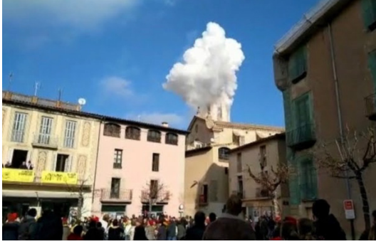
Figure 1. The bell tower seconds after the explosion.

The objective of this research is to show the characteristics of the accident occurred in Centelles (Spain) on December 30, 2019, the response of our Burn Center and the lessons learned from this event.