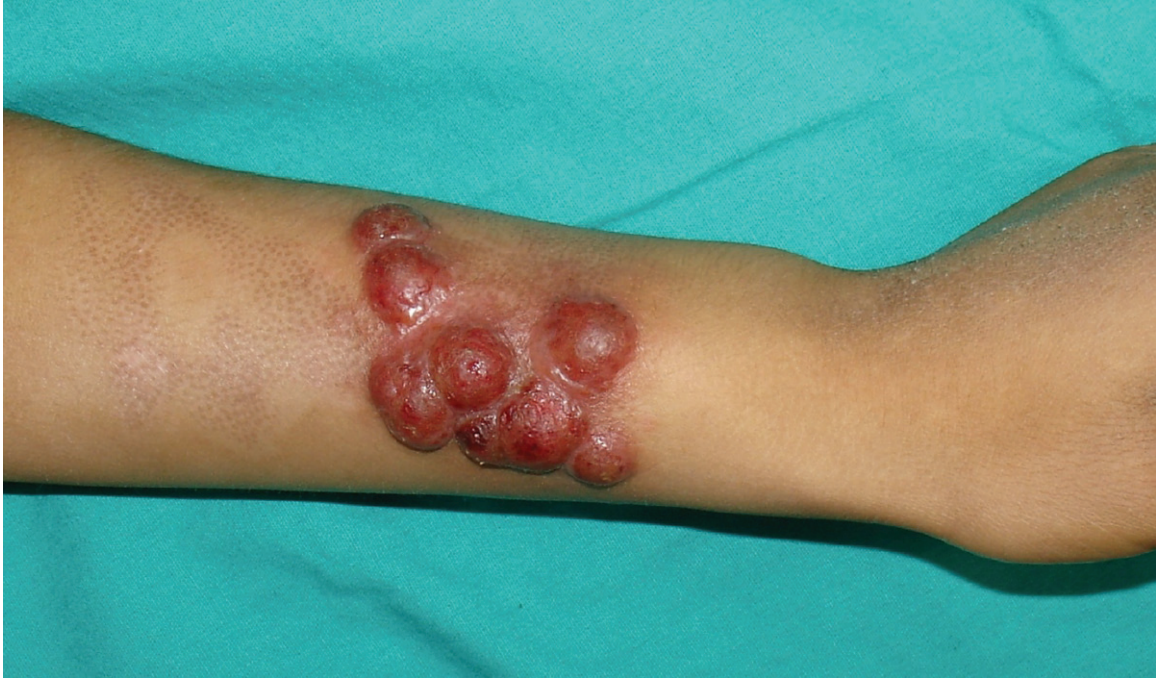
Figure 4. The appearance of the disseminated pyogenic granulomas on the patient's left forearm when he was admitted to our hospital 3 weeks after burn injury.