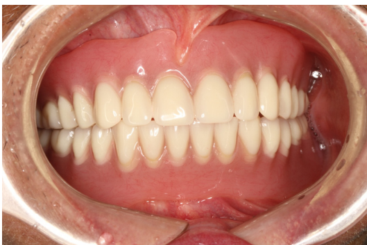
Figure 8. Intra oral view of the new complete denture.

operator-guided recording method. The little finger is placed behind the angle of the mandible with the other four fingers positioned on the lower border of the mandible. Thumbs should touch and fit into the notch above the symphysis. The operator manipulates the jaw hinged to the CR with a very gentle touch. Forceful mandibular retrusion by the operator