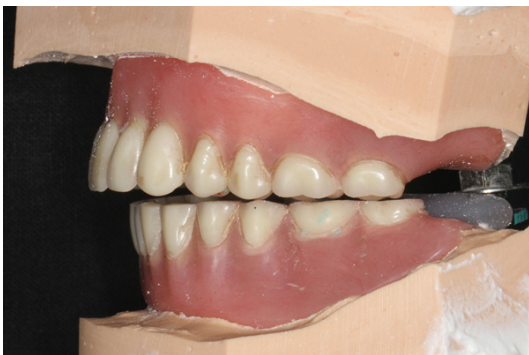
Figure 7. The new mandibular position obtained by the Gothic arch tracer was posterior to the previous mandibular position.