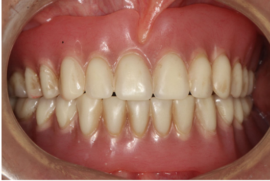
Figure 3. Simultaneous bilateral contact in the protrusion position.