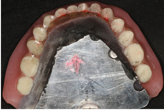
Figure 6. The Gothic arch apex for the CR was obtained.