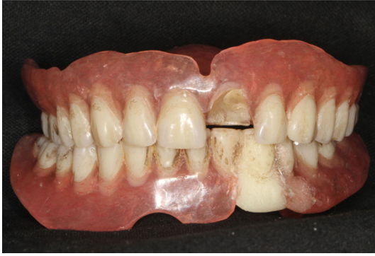
Figure 1. Old complete denture.