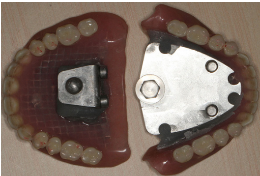
Figure 5. Mounting the Gothic arch tracer to the existing complete denture.

were the only point of contact during the mandibular protrusion and laterotrusion movement by grinding the bilateral mandibular artificial teeth for approximately 2 mm. Repetitious trainings were performed for the patient's mandibular protrusion and laterotrusion movements until an accurate arrow point tracing (Gothic arch apex, GoA) was obtained (Fig-