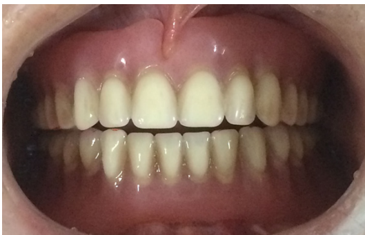
Figure 4. Anterior artificial teeth were horizontally overlapped by approximately 2 mm in the relaxation position.