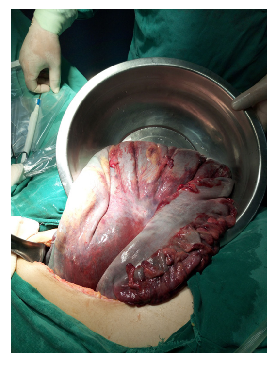
Figure 3. The exposed ischemic dilated loops of sigmoid colon with visible volvulus. The sigmoid colon was necrotic and the color became dark brown due to poor circulation.

A gastroenterology team had been consulted and had performed abdominal exams on the patient. Intestinal obstruction was highly suspected based on the clinical manifestations and the radiograph result. With no evidence of acute peritonitis, the two teams decided to apply sustained non-operative gastrointestinal decompression and enema to relieve the abdominal symptoms and to prepare an induced preterm labor. Propess was given in vagina at 15:51 PM and at 20:50 PM on