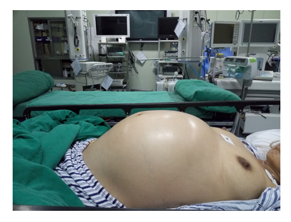
Figure 1. The distended abdomen of the patient after the vaginal labor, with an abdominal girth of 105 cm.