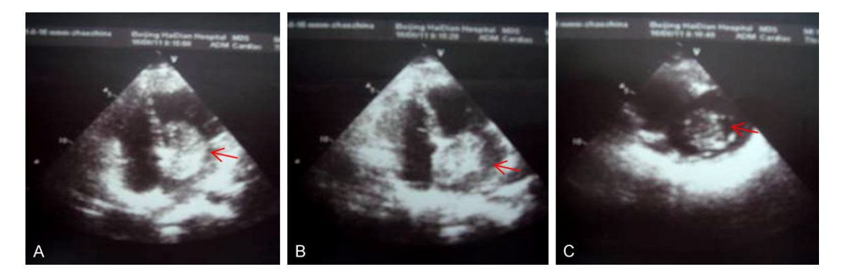
Figure 1. Transthoracic echocardiography demonstrated left atrial enlargement, and a large mobile middle-strong echo with regular surface in the left atrium, which originated from interatrial septum and prolapsed into the left ventricle through mitral valve during diastole, suggesting the diagnosis of atrial myxoma (A-C).