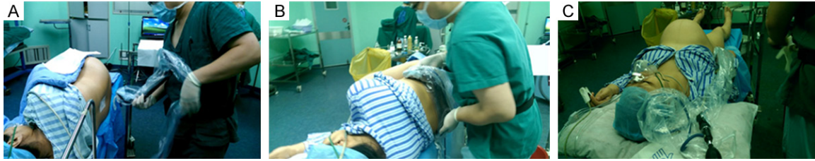
Figure 2. The installation position was at the rear waist (A) so that the bilateral air bags could be located at the soft spots between the left and right rib edges and the ilium (B) Each patient was then quickly placed in the supine position (C), and then the airbags were pressurized so as to raise the uterus for 3 to 5 cm (balloon pressure 280~300 mmHg).