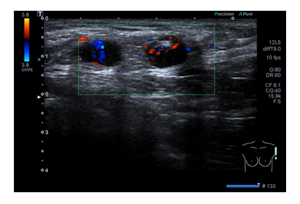
Figure 2. PET-CT result of the patient. The box showed the sentinel lesion areas in the left axillary tissues.

TTF-1, Napsin A ( Figure 3F, 3G ). According to above examination data, we strongly suspected these tumor cells were possibly come from breast tissue of the patient. While left axillary tissues were examined by excisional biopsy of the lesion, axillary accessory breast tissues was found cancer cells ( Figure 3A ).