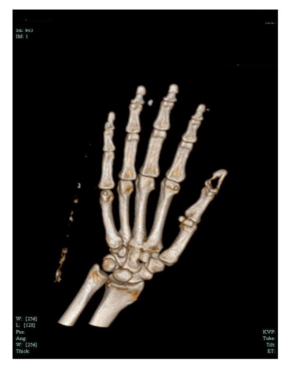
Figure 3. The preoperative CT reconstruction showed the large bony defect on the dorsal part of the distal phalanx.

The surgical incision for enchondroma in the distal thumb can be palmer, dorsal, lateral or fish mouth Dorsal incision over the distal phalanx may cause iatrogenic nail bed damage [8]. Every incision has its own advantages and disadvantages. According to the result of preoper-