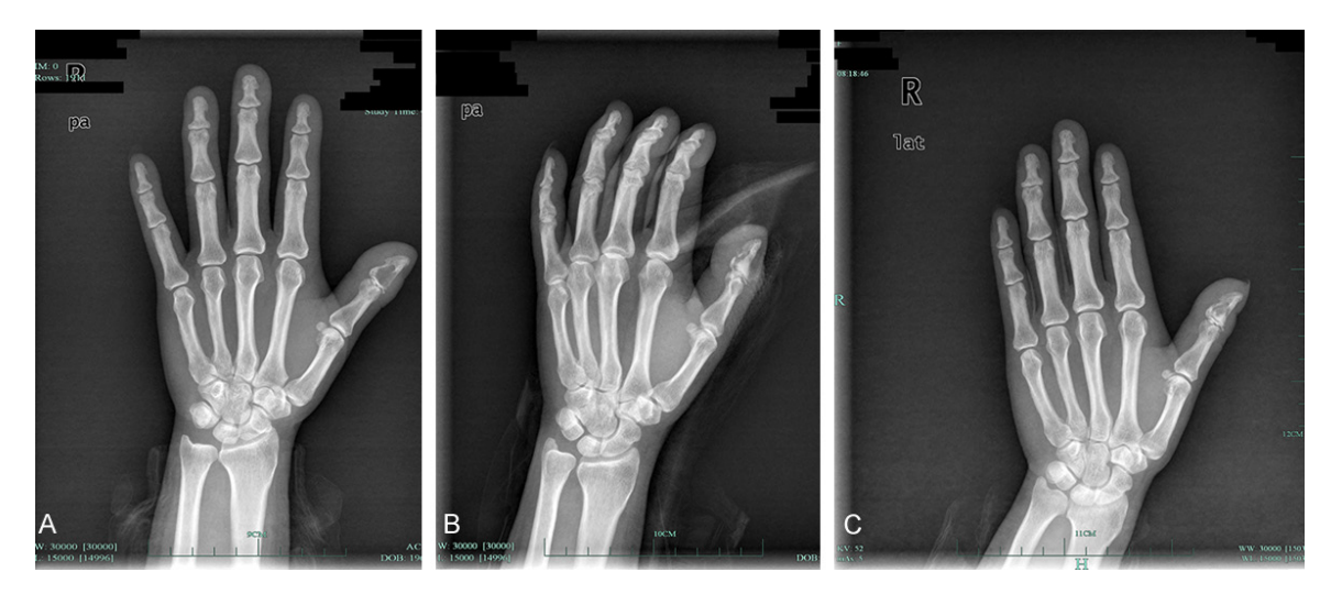
Figure 2. A. Plain radiographs revealed cortex thinning, bony defect, and soft tissue swelling in the distal phalanx of the thumb before surgery. B. Bone grafting in the distal phalanx of the thumb three months after surgery. C. Bone regeneration was noted radiographically with no evidence of recurrence after two years.