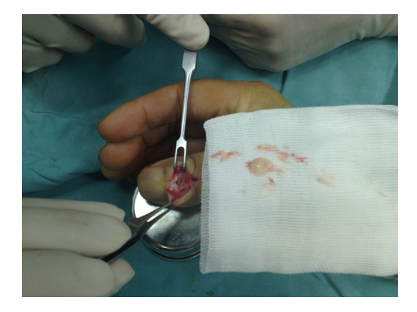
Figure 4. Degeneration and necrosis, residual tumor tissue, and inflammatory granulation were found intraoperatively.

The surgical incision for enchondroma in the distal thumb can be palmer, dorsal, lateral or fish mouth Dorsal incision over the distal phalanx may cause iatrogenic nail bed damage [8]. Every incision has its own advantages and disadvantages. According to the result of preoper-