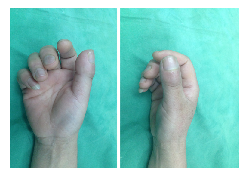
Figure 1. The thumb presented as clubbed finger, marked erythematous swelling and pus on the eponychium could be seen.

to perform full motion of the thumb. Three months after the surgery, bone regeneration was noted radiographically, and the patient could do full weight exercises. Clinical and radiological follow-up were performed for two years, no evidence of recurrence was noted after surgery ( Figure 2B , 2C ).