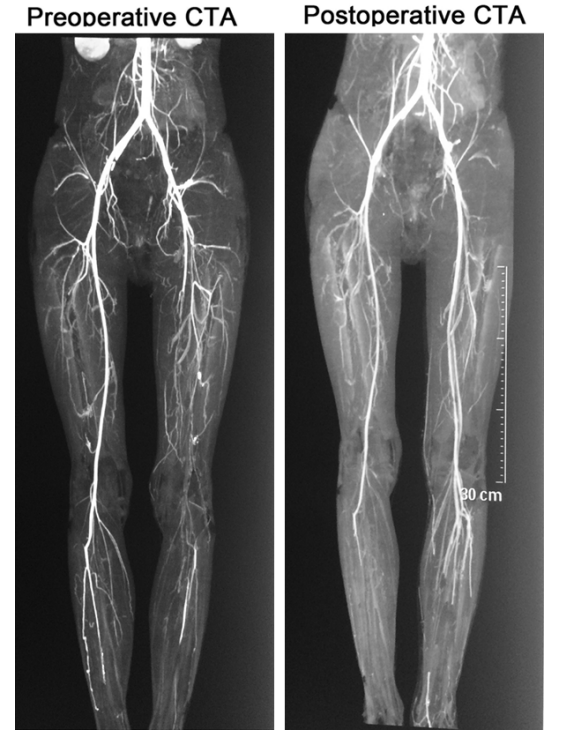
Figure 3. Pre and post-operative computed tomography angiography (CTA).

sympathetic ganglion were reserved. Subsequently, angiography was performed to determine the lesion region, and then balloon dilatation were carried out using microcatheter combined with V18 or PTII guide wire. Artery incision was sutured using CV6 or CV7 vascular sutures.