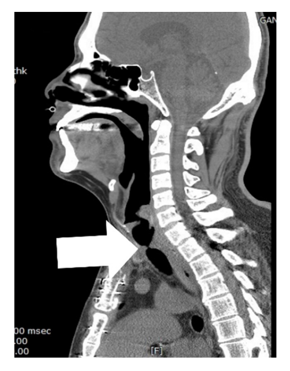
Figure 1. Preoperative head and neck computed tomography. The patient exhibited an extrathoracic tracheal stenosis (A white arrow).

maintained with sevoflurane and continuous infusion of remifentanil. The patient was ventilated with a tidal volume of 6 ml per an ideal body weight, and the respiratory rate was adjusted to maintain end-tidal CO, between 35 and 40 mmHg. 2) After LMA insertion, the tracheal stenosis site was visualized with a fiberoptic bronchoscope, and the surgeon could localize the stenotic area in the surgical field by the light emitted by the bronchoscope. After dissection of distal cricoid cartilage and proximal trachea, the trachea was opened distal to the stenosis, and a sterile reinforced tube (internal diameter, 6.0 mm) was placed in the lower trachea (Figure 3). Then, patient was ventilated via distal tracheal tube, and the stenotic lesion including distal cricoid cartilage was resected. 3) When end-to-end anastomosis was achieved, a silastic tracheal tube (internal diameter, 6.0 mm) was inserted via the LMA, and the distal tracheal tube was removed. An air leakage test on the anastomotic line and bleeding control were performed. 4) Before wound closure, the tracheal tube was replaced with an LMA for visualization of the anastomosis site with fiberoptic bronchoscopy.