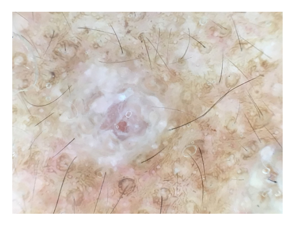
Figure 2. Dermoscopy image of multiple warty dyskeratoma. Pale to gray area with center depression.

tosis [1]. Although a male predisposition has been reported previously, while Kaddu reported a series presenting male/female (M/F) ratio is 1:1.8 [5]. The pathogenesis of warty dyskeratoma has not been elucidated. Studies have suggested that it is associated with ultraviolet light, autoimmunity, chemical carcinogens, and tobacco [8]. The most common clinical presentation is a circumscribed isolated cup-shaped papule or nodule located on the head or neck