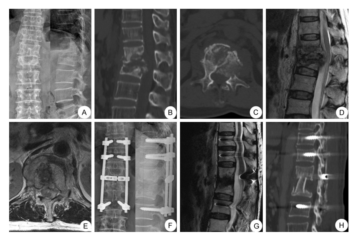
Figure 2. A 68-year-old female with T12/L1 lesions received combined posterior and anterior approaches. The pre-operative imaging data ((A) plain antero-posterior and lateral, (B) CT lateral, (C) CT cross section, (D) T_2 MRI lateral, (E) T_2 MRI cross section) presented with severe bone destruction, paravertebral abscess formation, and severe compression of spinal cord at T12/L1. The postoperative radiography ((F) plain antero-posterior and lateral) indicated that the kyphosis was improved. MRI ((G) T_2 MRI lateral) showed satisfied decompression of spinal cord without paravertebral abscess or relapse of Pott's disease at the final follow-up. CT-scan ((H) CT lateral) showed satisfied bone fusion at the final follow-up.