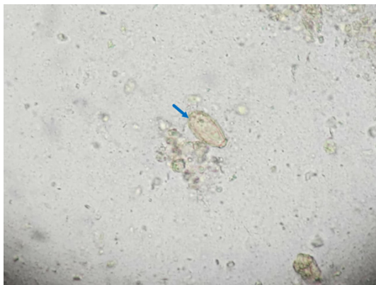
Figure 2. The eggs of C. sinensis (blue arrow) detected in stool using Kato-Katz method; magnification \times 100 .

patient reported no history of hepatitis or alcohol abuse. To confirm the diagnosis and to assess the ER, PR, and HER2 status of the suspected metastatic lesion, an ultrasonography-guided core needle aspiration of the liver mass was performed. Unexpectedly, no cancer cells were seen in the aspirated specimen, but diffuse eosinophil infiltration was observed. Based on the eosinophil infiltration in the liver