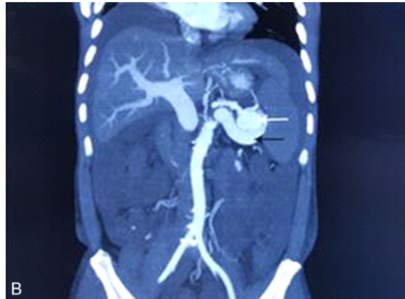
Figure 1. Contrast-enhanced abdominal CT. A: In the arterial phase, splenic artery (black arrowhead) and the widened portal vein (white arrowhead) are filling contrast-medium. B: A coronal computed tomography angiography (CTA) demonstrating the splenic artery aneurysmbetween the splenic artery (black arrowhead) and the splenic vein (white arrowhead).

into the right femoral artery. Selective celiac and splenic artery angiography showed a large splenic artery aneurysmal expansion, a dilated splenic vein and an enlarged portal vein in the early arterial phase. Combined with the patient's history,the patient was diagnosed with SAVF (Figure 2A).