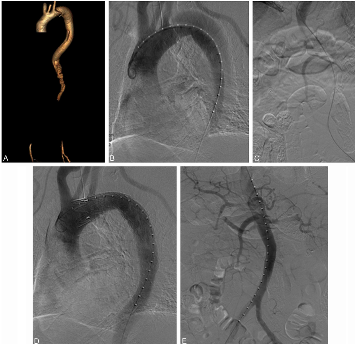
Figure 2. Management of acute abdominal aortic occlusion caused by aortic artery dissection (Debakey III). Diagnosis was made via compute tomography angiography (A) and confirmed by arteriography (B, C). Emergent endovascular aortic repair was performed (D), and then the blood flow of obstructive artery was restored (E).

nal perforation respectively. Both of them were treated with fasting, nutritional support, omeprazole and hemostatics. And both of them recovered.