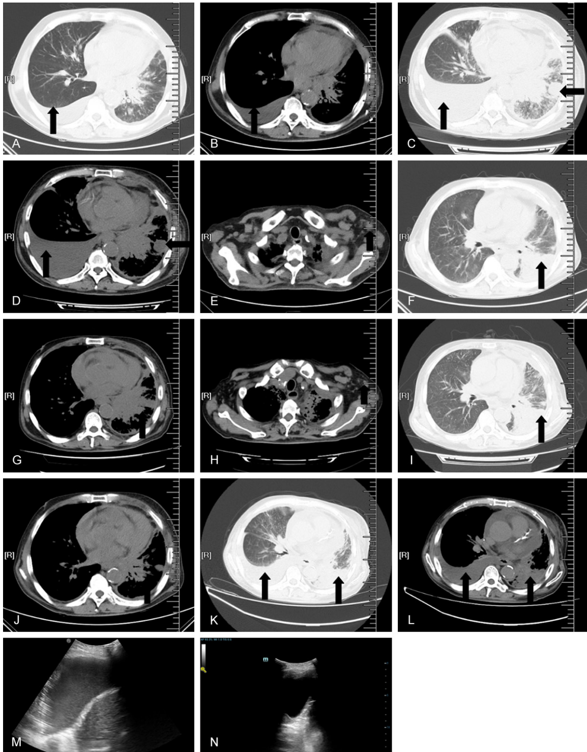
Figure 2. Chest computed tomography (CT). A, B. The chest CT scan reveals pleural effusion of the right mediastinal window before icotinib treatment on August 24, 2016; C, D. CT showed that bilateral pleural effusions was significantly progressed more than before and pulmonary nodules were similar to previous readings after icotinib treatment for 17 days on September 10, 2016; E-L. Shows the left axillary lymph nodes, pericardial effusion, pleural effusion and pulmonary nodules. E-G. Chest CT indicated that pulmonary nodules, bilateral pleural effusion, the left axillary lymph node and pleural effusion before apatinib treatment on September 27, 2016; H-J. CT shows that the left axillary lymph node was smaller than before, pericardial effusion was less than before, but pleural effusion and pulmonary nodules were stable after apatinib treatment for 4 days on October 7, 2016; K, L. Apatinib treatment for 52 days (November 25, 2016), the pleural effusion of the right appeared again and the pleural effusion of the left increased more than before (October 7, 2016). The patient PFS has increased to 52 days after taking apatinib. M.