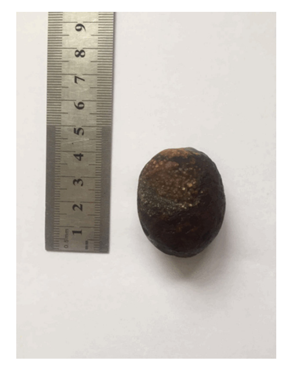
Figure 4. Gallstone excreted through the anus.