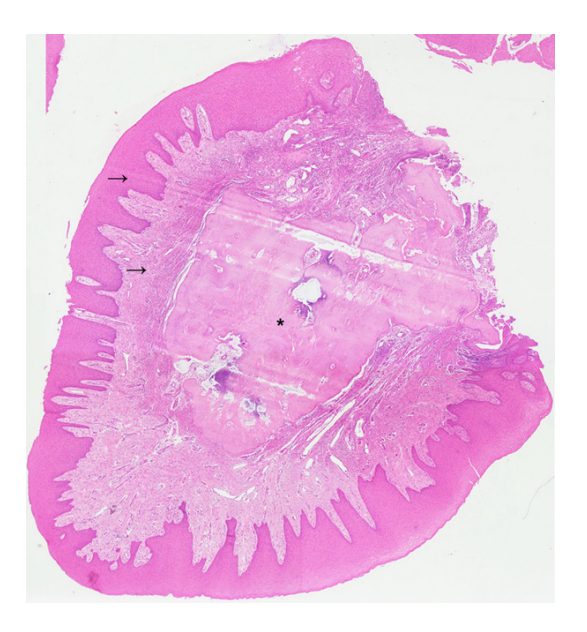
Figure 3. Histopthological analysis of an excised peripheral ossifying fibroma observed 4 months after the extraction of a natal left mandibular central incisor in a 1-day-old boy. Fibrous connective tissue with nonulcerated epithelial tissue (indicated by the arrows) and a focal calcified structure (indicated by *) can be observed.