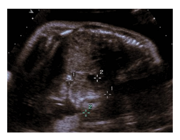
Figure 4. Sonographic image displaying an omphalocele in the autosite.

Consent for a full post-mortem examination was granted. Only one placenta was present with a single umbilical cord. The total weight of the abortus was 1110 g and 33 cm in length. External inspection showed that the autosite was connected with the parasite in the epigastrium, which had a pelvis, two well-developed limbs, and two rudimentary upper limbs. The autosite had cyclopia, a proboscis (Figure 5A) and an omphalocele and imperforate anus (Figure 5B). A detailed autopsy examination in the autosite disclosed exstrophy of the bladder, cryptorchism, a split penis, and multiple malformations, including holoprosencephaly (Figure 5C), spina bifida occulta, an atrioventricular canal defect (Figure 5D), and an aortopulmo-