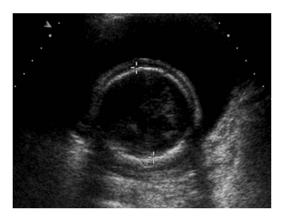
Figure 1. An axial sonographic image with biparietal diameter measurement showing a single ventricle cavity in the autosite.

PDA, patent ductus arteriosus; CHD, congenital heart disease; CoA, coarctation of aorta; VSD, ventricle septal defect; ASD, atrial septal defect; PFO, patent foramen ovale; TGA, transposed great arteries.