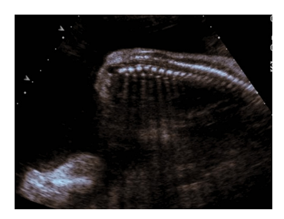
Figure 3. Sagittal sonographic image through a fetal spine showing spinal bifida in the autosite.

and a single placenta was located anteriorly to the uterus. A single umbilical cord was inserted from the autosite to the placenta. The estimated gestational age of the autosite was 24 weeks. Together, these prenatal findings suggested heteropagus and an autosite associated with holoprosencephaly, spinal bifida, cyclopia, a proboscis, an omphalocele, and congenital heart defects. Amniotic fluid samples were obtained from the conjoined twins via amniocentesis under ultrasonic guidance, and amniotic fluid cells were cultured for 1 week, followed by G-banding karyotype analysis using a Metascan Karyotyping System (Imstar S.A., Paris, France). The chromosomal phenotype of conjoined twins was 46XY. The family decided to terminate the pregnancy after consulting an obstetrician and pediatrician due to the poor prognosis of holoprosencephaly at the autosite.