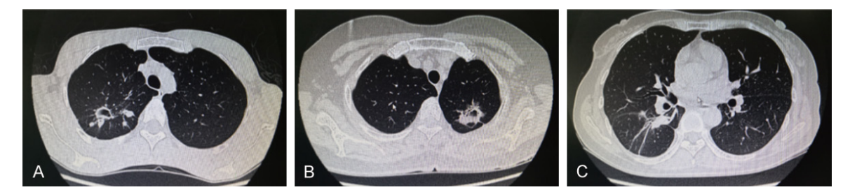
Figure 1. The diagnosis of patients and the postoperative pathological diagnosis were made by two experienced pathologists. A: Chest CT of a patient with tuberculosis (male, 26 years old). The chest CT revealed tuberculosis with cavity formation in the right upper lobe. The patient received anti-tuberculosis treatment for 9 months and video-assisted thoracoscopic surgery for resection of the right upper lobe. The postoperative pathological examination found necrotizing granuloma in the right upper lobe, considering tuberculosis, the molecular pathological test showed positive results for mycobacterium tuberculosis. B: Chest CT of a patient with lung cancer (female, 28 years old). The chest CT revealed irregular mass shadow with cavity formation in the left upper lobe. Video-assisted thoracoscopic surgery and mediastinal lymphadenectomy were performed. Postoperative pathological examination showed infiltrative adenocarcinoma in the left upper lobe, pT2NOMO. C: Chest CT of a patient with bronchodilation and aspergillus infection.

treatment to prevent the progression of bacteriologically-negative pulmonary TB and to reduce the spread of this disease [11].