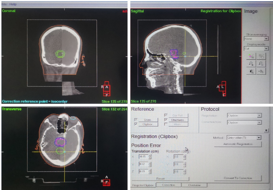
Figure 2. Comparison of the planned CT image of the head tumor IMRT and the post-setup CBCT image in the pc period. Note: the above image was made during the pc period, with a deviation in the X, Y, and Z directions of (-0.5, 0.2, 0.9) mm.