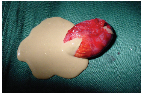
Figure 4. The mass contained a thick, greasy-looking substance.