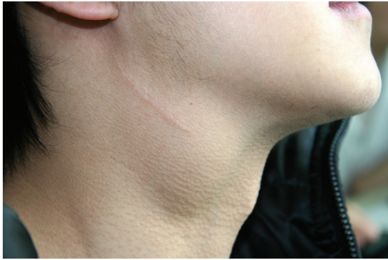
Figure 1. A 20 year-old man presented with submandibular swelling on the right side of the neck. A 3cm long scar was found on the skin within the swollen area.