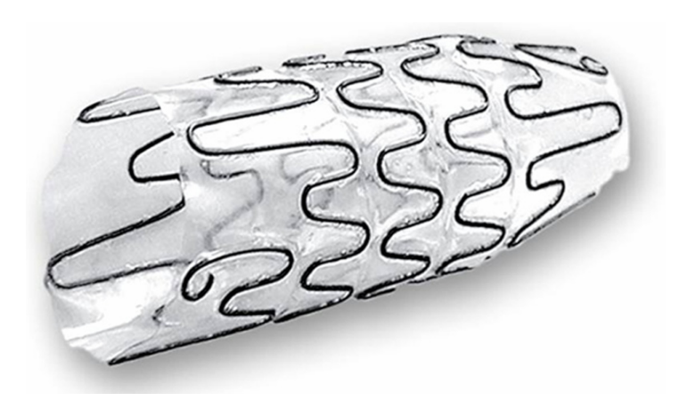
Figure 1. Specially designed Allium BUS; fully covered, self-expandable, large caliber metal stent.

All patients provided informed consent form and underwent urethral stent placement. Internal urethrotomy was performed prior to stent placement. Stricture length was documented, as well as stricture etiology and prior stricture treatment.