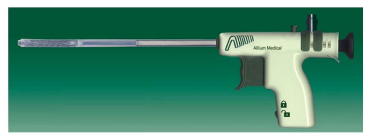
Figure 2. Gun-like delivery system of Allium BUS on which stent is mounted.