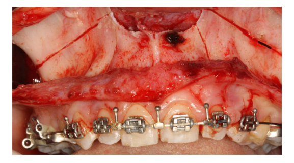
Figure 2. LeFort I osteotomy and partial segmented osteotomy performed before of down fracture.

This began with the BS1 tip (straight 10 mm deep and 2.5 mm wide), executing the LeFort I osteotomy from the right side between the pyriform aperture and the maxillary zygomatic buttress. Then the BSL tip (straight 1.5 mm deep, 3 mm wide and 1 mm thick) was used for the osteotomy behind the maxillary zygomatic buttress as far as the pterygoid fossa; the same procedure was used for the contralateral osteotomy. Then the curved Obwegeser osteotome was used in the pterygoid fossa, a vomer chisel in the nasal septum and with the BSL tip the osteotomy was performed on the medial wall of the maxillary sinus, following up to 20 mm posterior. Access was gained with Wagner osteotome to finalize the osteotomy of the medial