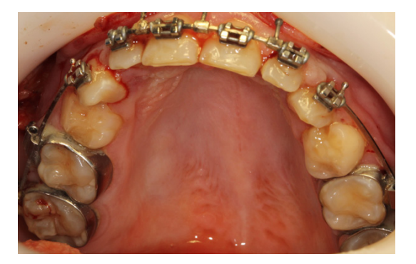
Figure 4. Palatal soft tissue after segmented LeFort I Osteotomy, showing absence of laceration, edema or other complication related to the osteotomy.

This technique has been reported as successful in other procedures [3] and it has been described that its use presents great advantages, such as 1) clarity and control in the osteotomy, 2) decrease in the severity of tissue separation and detachment, 3) irrigation in the system itself, reducing the need for irrigation by the assistant, 5) lower risk of injuring soft tissues and vascular structures.