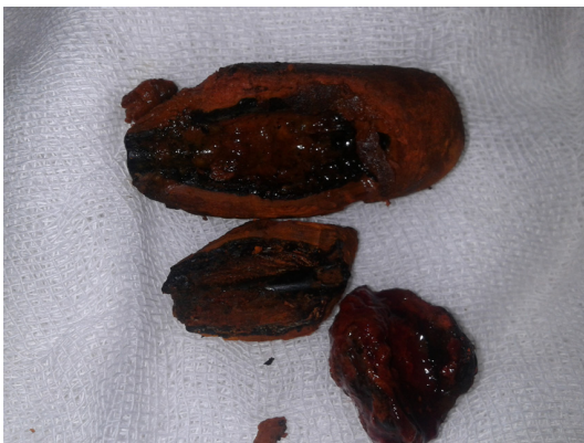
Figure 3. Stones are surgically removed by choledochotomy.

The major disadvantage of this technique is the clogging of the endoprosthesis, which happens only a few days or several months later, and makes necessary frequent endoprosthesis exchanges to prevent cholangitis. We know that the sphincter of Oddi acts as a mechanical barrier, preventing the regression of the duodenal contents. The breakdown of this barrier with sphincterotomy or transpapillary insertion of an endoprosthesis results in microbial infection of the bile by ascending infection [18-20]. Additionally the presence of a foreign body in the biliary system has been proven to facilitate bacterial adhesion and biofilm formation [19]. However, when endoprostheses are used in nonextractable choledocholithiasis, they can