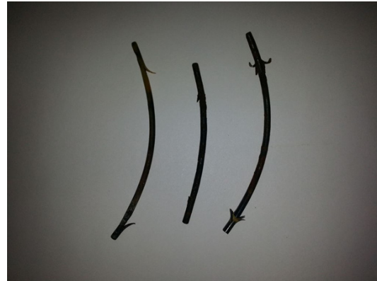
Figure 4. Samples of forgotten or omitted stents.

The major disadvantage of this technique is the clogging of the endoprosthesis, which happens only a few days or several months later, and makes necessary frequent endoprosthesis exchanges to prevent cholangitis. We know that the sphincter of Oddi acts as a mechanical barrier, preventing the regression of the duodenal contents. The breakdown of this barrier with sphincterotomy or transpapillary insertion of an endoprosthesis results in microbial infection of the bile by ascending infection [18-20]. Additionally the presence of a foreign body in the biliary system has been proven to facilitate bacterial adhesion and biofilm formation [19]. However, when endoprostheses are used in nonextractable choledocholithiasis, they can