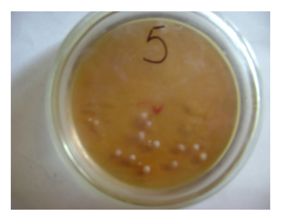
Figure 1. Candida colonies on Saburo medium after inoculation of contents of an atherosclerotic plaque (5th day).

cause candidiasis when immunity is compromised. Studies of the most widespread fungus Candida albicans have revealed that it produces specific substances, such as adhesions and ligands, which suppress affixing of neutrophils to Candida, and reduce chemotaxis of leukocytes. Mann proteins found on the cell walls constitute external antigens of Candida albicans, and also play a dominant role in processes of colonization, adhesions and infection of fungi of genus Candida. A series of experiments have revealed that a culture of Candida is capable of producing a water-soluble high molecular weight fraction CAWS, also consisting of mannoproteins and β-glycan. Investigations of the biological activity of CAWS have allowed to reveal a number of features. It was found out that CAWS induces the production IFN-φ and IL-6 by splenocytes at a low dose (10 µg/ml), but inhibits proliferation of splenocytes induced by polysaccharides and T-cell mitogens at a high dose. In addition, CAWS blocks the production of trombodulin by endothelial cells and synergizes with TNF \alpha , which in turn activates the curtailing system of blood [11].