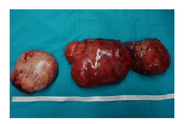
Figure 3. A picture of the removed surgical specimen including three tumors.

Rapid removal of tumor may lead to unexpected redistribution of blood or massive blood loss, these procedures cause complications