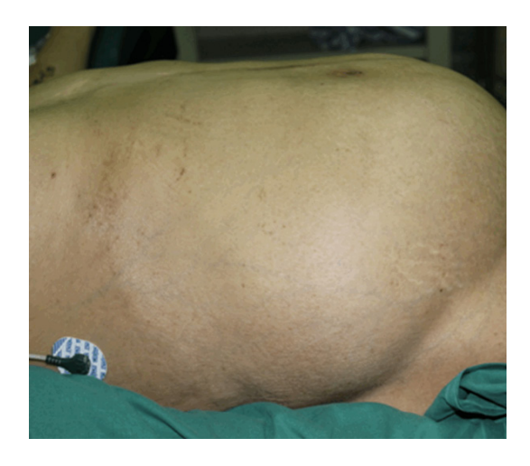
Figure 1. Preoperative view of the patient showed remarkably distended abdominal tumor.

thesia to measure ABP, CI and SVV were measured with a FloTract/Vigileo™ system (Edwards Lifesciences, USA). The patient was induced with midazolam 0.05 mg/kg, propofol 1.5 mg/ kg, fentanyl 2 µg/kg and vecuronium 0.1 mg/ kg intravenously, preoxygenation was done for 3 min before tracheal intubation was facilitated. Ventilation was mechanically controlled and adjusted to maintain end-tidal CO<sub>a</sub> at 30-35 mmHg. A central venous catheter (Edwards ifescience, Irvine, CA, USA) was inserted in his right internal jugular vein under ultrasound guidance to monitor CVP and to administer vasoactive drugs if necessary. Electrocardiogram, ABP, SpO<sub>2</sub>, CI, SVV, CVP and nasopharyngeal temperature were continuously monitored throughout the surgery. Anesthesia was maintained with intravenous propofol at 100 μg/kg/min. Remifentanil (0.25 μg/kg/min) was administered as analgesic intravenously. Intraoperative muscle relaxation was maintained with vecuronium (0.1 mg/kg). Since exposure of skin for prolonged periods and receipt of large volumes of intravenous and irrigation fluids, we kept the patient warm actively to avoid inadvertent perioprative hypothermia.