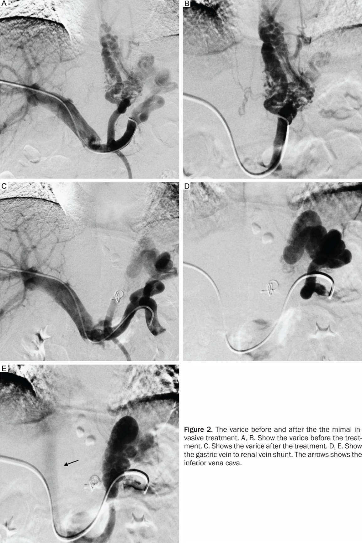
Figure 2. The varice before and after the the mimal invasive treatment. A, B. Show the varice before the treatment. C. Shows the varice after the treatment. D, E. Show the gastric vein to renal vein shunt. The arrows shows the inferior vena cava.