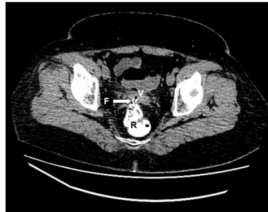
Figure 2. CT imaging of rectal perfusion in horizontal plane indicated contrast agent flowing into vaginal through the fistula at anterior rectal wall (arrow). V, vaginal; R, rectum; F, fistula.

Patients with vesicovaginal and rectovaginal fistulas due to radiation and recurrent fistulas were excluded from the study. The mean age of the patients was 44.8 \pm 9.1 years. The original operations were different in these patients and included 13 patients after laparoscopic or abdominal hysterectomy or simple salpingo-oophorectomy because of endometriosis ( n = 7 ), myoma of the uterus ( n = 3 ), endometrial cancer ( n = 2 ), and ovarian cancer ( n = 1 ), 2 after laparoscopic salpingo-oophenrectomy for pelvic abscess, and 2 after pelvic floor reconstruction for pelvic organ prolapse (Table 1).