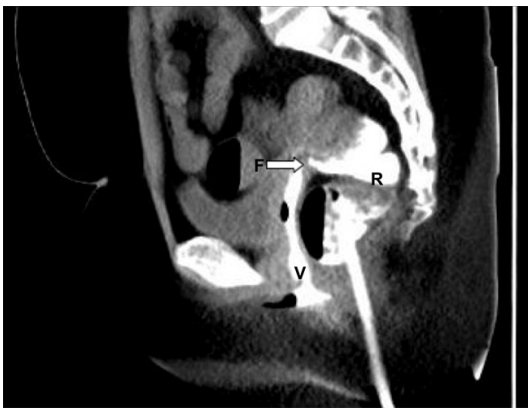
Figure 1. A 58 years old female patient with endometrial cancer received laparoscopic hysterectomy, oophorectomy and pelvic lymphadenectomy. However, vaginal exhaust and defecation occurred 2 weeks after surgery. The patient underwent laparoscopic repair of rectovaginal fistula 2 months after surgery. CT imaging in the coronal plane of rectal perfusion before surgery showed contrast agent flowing into vaginal through the rectovaginal fistula (arrow). V, vaginal; R, rectum; F, fistula.

Patients with vesicovaginal and rectovaginal fistulas due to radiation and recurrent fistulas were excluded from the study. The mean age of the patients was 44.8 \pm 9.1 years. The original operations were different in these patients and included 13 patients after laparoscopic or abdominal hysterectomy or simple salpingo-oophorectomy because of endometriosis ( n = 7 ), myoma of the uterus ( n = 3 ), endometrial cancer ( n = 2 ), and ovarian cancer ( n = 1 ), 2 after laparoscopic salpingo-oophenrectomy for pelvic abscess, and 2 after pelvic floor reconstruction for pelvic organ prolapse (Table 1).