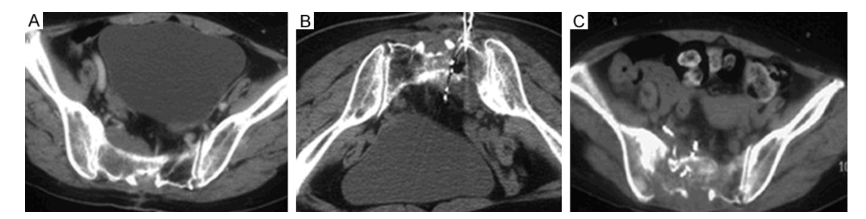
Figure 2. Combination of NCPB and implantation of 125I particles. A: Male, 47 years old, had the bone metastasis of meningioma, suffering from the continuous pains in the sacrococcygeal region and left lower extremity. B: The patients was in the prone position, and implanted the total 50 particles of 125I twice, as well as 30 ml mixture of 99.5% dehydrated ethanol and ultra-liquefied lipiodol (ratio as about 9:1). C: The pain in the left lower extremity significantly improved 1 day after the surgery. The 3rd-month CT recheck revealed that the particles and ultra-liquefied lipiodol evenly distributed inside the lesions.

the particle implantation needle by the CT guidance and TPS plans. After the surgery was completed, the implant needle was removed and the incisions were dressed and compressed. The postoperative three-day routine used antibiotics and haemostatic drugs to prevent postoperative infection and bleeding. One month after the surgery, a CT scan was conducted to perform the post-TPS dose verification and to determine if the particle therapy was needed as a complementary treatment when current management was insufficient.