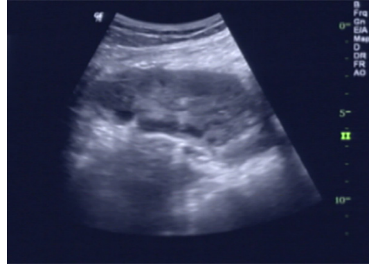
Figure 3. Right ovary in the ultrasoundgram on 7 th June 2014.