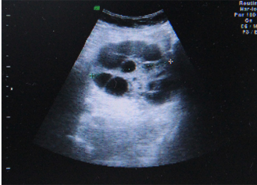
Figure 1. Right ovary in the ultrasoundgram on 16 th April, 2014.