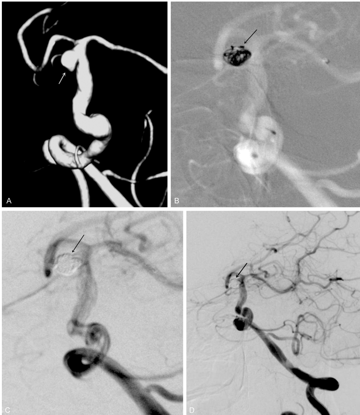
Figure 2. A. The positive side of the left vertebral artery and three-dimensional imaging shows the left superior cerebellar artery aneurysms. B. During procedure vertebral angiogram shows the aneurysm (arrow) of left SCA. C. Post-procedure vertebral angiogram shows aneurysm was occluded completely (arrow) with endovascular coil embolization. D. Control angiogram shows stable occlusion (arrow) of the aneurysm.

after admission showed an aneurysm of the SCA (Figure 3A and 3B). Twenty two hours after episode, endovascular embolization was performed. Standard heparin protocol was followed and an activated clotting time greater than 250 s was maintained during the procedure. A 6F Envoy (cordis) guiding catheter was