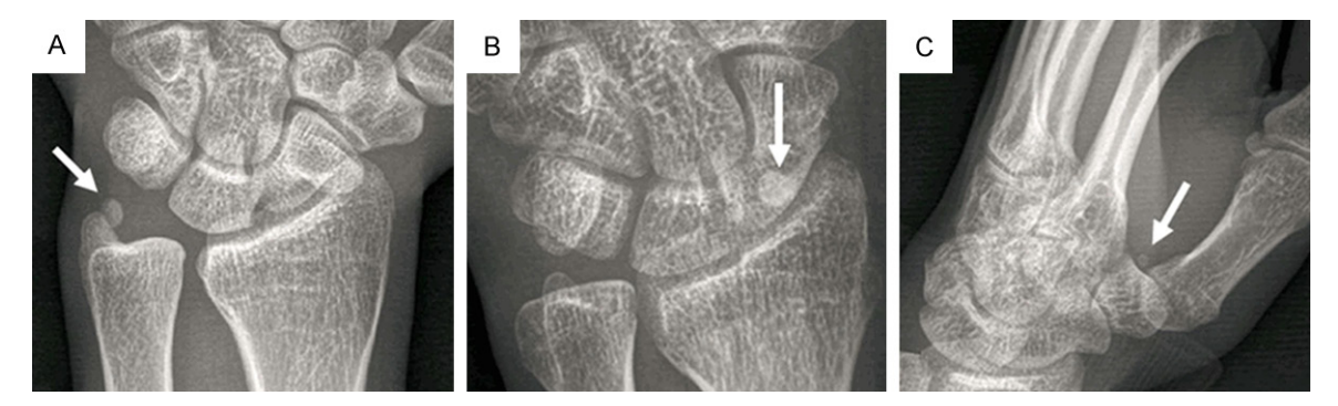
Figure 2. The posteroanterior X-ray films show the sesamoid bones at the ulnar styloid (A), the scaphoid (B) and the base of the first metacarpal (C).