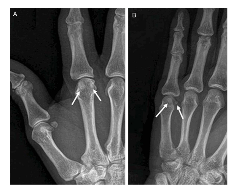
Figure 1. The posteroanterior X-ray films of the index (A) and little fingers (B) both demonstrate two sesamoid bones (arrows) at the metacarpophalangeal (MCP) joints.

MCP: metacarpophalangeal joint; IP: interphalangeal joint; I: Thumb; II: Index Finger; III: Long finger; IV: Ring Finger; V: Small finger.