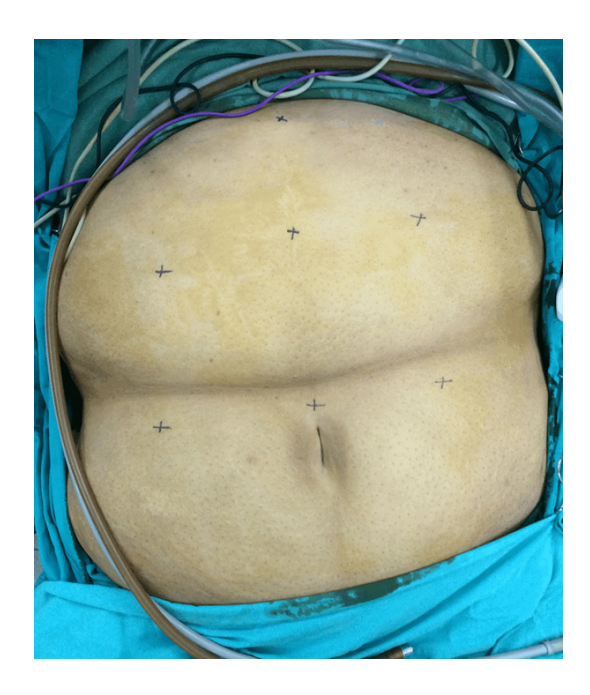
Figure 1. Trocar placement for LRYGB.

GJ with Orvil^{TM} and manually tilted head of the anvil (hand-made Orvil).