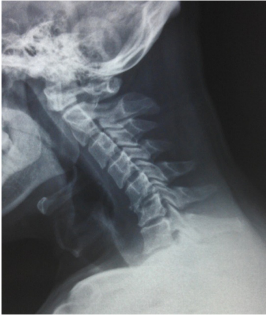
Figure 1. Segmental kyphotic position due to collapse of C5-6 intervertebral disc.

Lateral neck X-ray showed a disc height loss at C5-6 and C6-7, with the whole cervical spine in an abnormal kyphotic position ( Figure 1 ). A follow-up cervical MRI showed signal changes indicating osteomyelitis in the C5 and C6 vertebral bodies with a C5-6 disc space infection and epidural collection ( Figure 2 ). A CT scan of the same region revealed a wormy appearance at the involved level ( Figure 3 ).