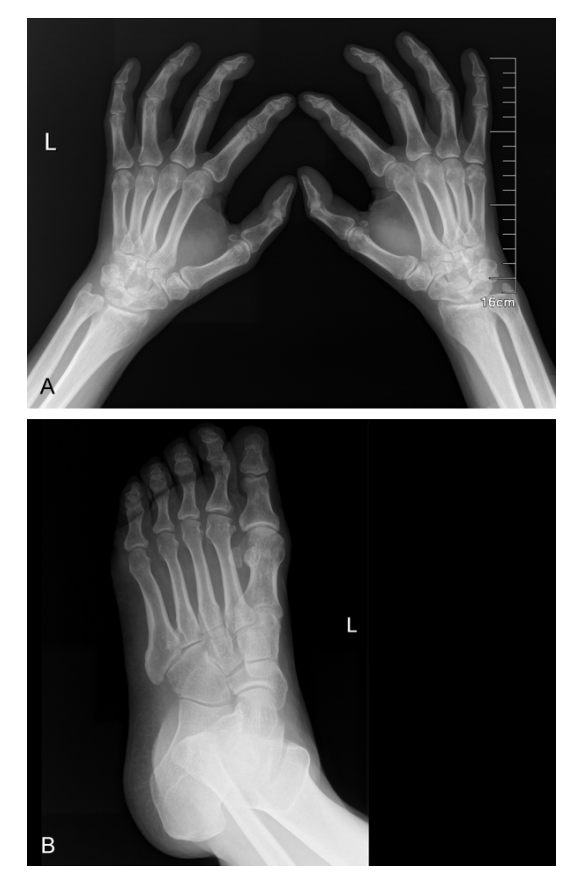
Figure 1. In A: Hand X-rays showing a symmetric decrease in joint spaces and periarticular osteoporosis in the proximal metacarpophalangeal and interphalangeal joints; In B: Swelling of soft tissue in the left ankle joint. (April 3, 2015).

Spirometry revealed an FVC of 2.92 L (72% of predicted), an FEV<sub>1</sub> of 2.24 L (69.4% of predicted), an FEV<sub>1</sub>/FVC ratio of 0.76, and an FEF25-75% of 1.89 L/S (53.3% of predicted). The rheumatoid factor (RF) was 197.5 IU/mL, the test result for antinuclear factor was negative, and the erythrocyte sedimentation rate was 28 mm in the first hour.