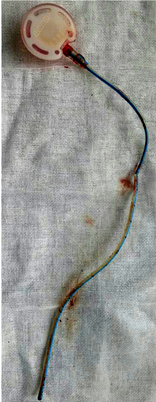
Figure 3. The fractured catheter of TIVD.

fracture and 3 cases of catheter disruption. 1 catheter fracture was in the ministry of turn-back, also was the puncture position, nurse found the swelling subcutaneously in the cervical part when they infusion, X-ray confirm the catheter fracture. Two cases of catheter fracture occurred in the intravenous catheter, and another case of catheter fracture occurred in