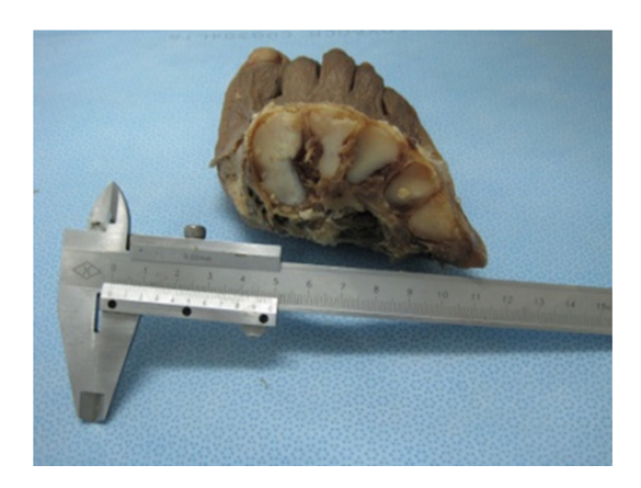
Figure 1. The detached first/second metatarsal articular surface.