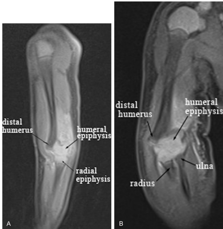
Figure 2. A. MRI scan of the injured right elbow. Sagittal image showing the cartilaginous distal humeral epiphysis. It has fractured and displaced posterior in relation to the shaft of the humerus. The humero-radial articulation is intact. This confirms the diagnosis as fracture-separation of the distal humeral epiphysis. B. MRI scan of the injured right elbow. Coronal image showing the cartilaginous distal humeral epiphysis. It has fractured and displaced medial in relation to the shaft of the humerus. The humero-ulnar articulation is intact. This confirms the diagnosis as fracture-separation of the distal humeral epiphysis.

ry or shear forces on the elbow, which can be caused by child abuse or birth trauma in young infants, are probably more responsible for this injury in young children [11]. Third, a hyperextension force on an outstretched arm may cause the injury in children [12].