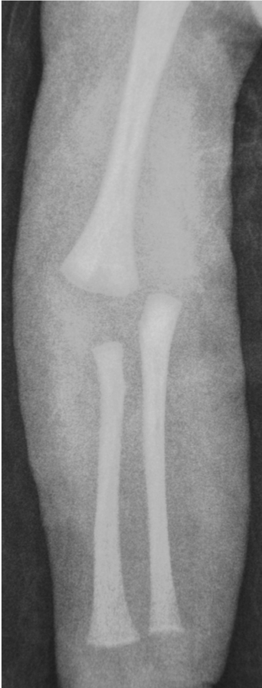
Figure 1. Anteroposterior (AP) view of elbow radiograph showing the ossification centre of the capitulum is not visible in this newborn. The proximal radius and ulna maintain an anatomic relationship to each other but are displaced medially in relation to the distal humerus.

humeral epiphysis with posteromedial displacement ( Figure 1 ). The sixth day after birth, the MRI of right elbow confirmed the diagnosis of this injury ( Figure 2A and 2B ). The ninth day