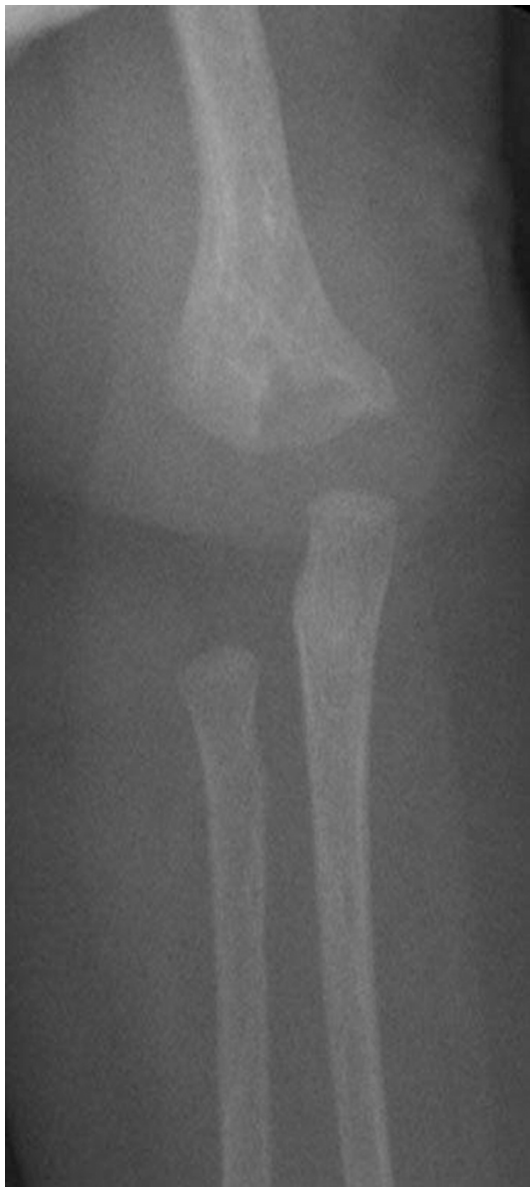
Figure 5. Anteroposterior (AP) radiograph of the elbow taken two months postoperatively showing a normal alignment between the proximal radius and ulna with respect to the distal humerus.

planes. All components of the injury are directly visualised, allowing more precise definition of the acute injury. It does not use ionising radiation and the elbow does not have to be manipulated to obtain the images [14]. Six cases who had been performed MRI had been reported in the past literatures [1, 4, 7, 8, 14, 19]. MRI revealed a fracture-separation of the distal humeral physis with posteromedial displacement. The potential problem with MRI is getting the baby to lie still in the scanner and this usu-