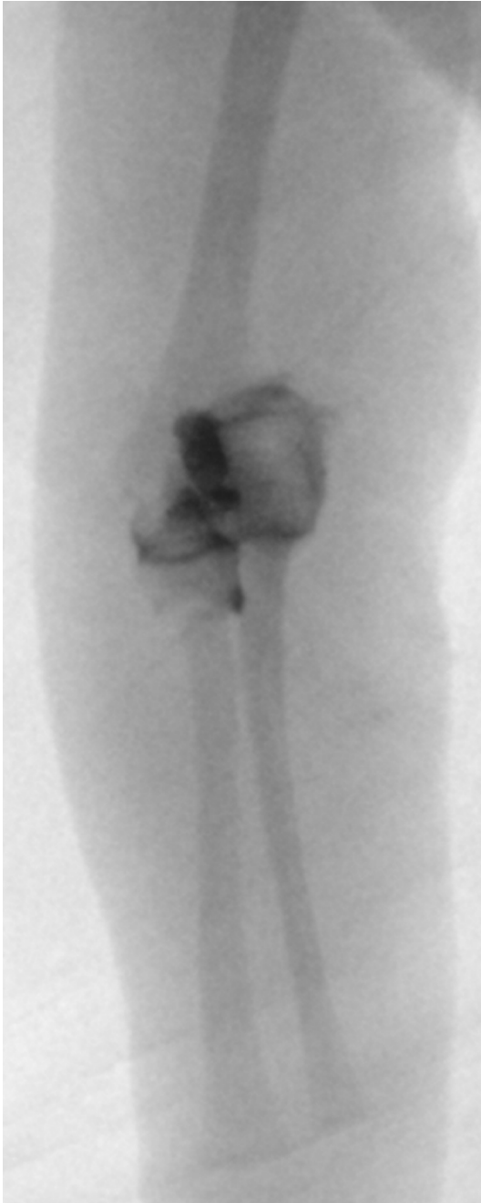
Figure 3. The elbow arthrography before closed reduction demonstrating the proximal radius and ulna are displaced medially in relation to the distal humerus.

tures in the distal metaphyseal region of the humerus or in the proximal radius and ulna [6]. Plain radiographs cannot detect fracture-separation until the capitellar ossification center appears or until some new bone is laid down by the elevated periosteum. Thus, radiography is inconclusive in distinguishing between dislocation and fracture-separation [14].