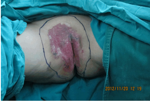
Figure 1. Macroscopic appearance of Paget's disease of the vulva. Pink plaque extended through the pubic area and left great labia.