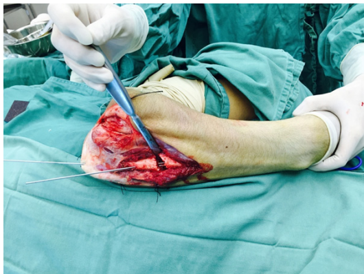
Figure 3. The ulnar osteotomy. A Kocher approach was used, with the skin incision extended along the ulnar shaft. An oblique osteotomy was performed at the proximal metaphysis of the ulnar shaft. The osteotomy site was distracted and angulated to overcorrect the deformity, which was temporarily fixed using two K-wires.

ed by the incision. An oblique osteotomy was performed at the proximal metaphysis of the ulnar shaft. The osteotomy site was distracted and angulated to overcorrect the deformity of the right ulna. The osteotomy site was tempo-