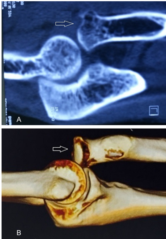
Figure 2. Hypoplasia of the right radial capitellum. Two-dimensional CT (A) and three-dimensional CT (B) indicate that the right radial capitellum had become deformed (open arrows).