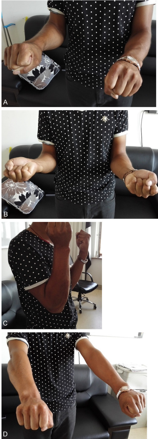
Figure 5. The patient exhibited excellent range of motion of the right arm at the 1-year follow-up after his ulnar osteotomy. A. Pronation. B. Supination. C. Flexion. D. Extension.

rect chronic radial head dislocation and secondary ulnocarpal impaction syndrome. Excellent results were obtained, including