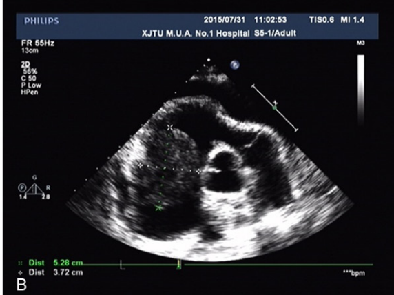
Figure 1. Right Atrial Mass on Echocardiography (A, B).