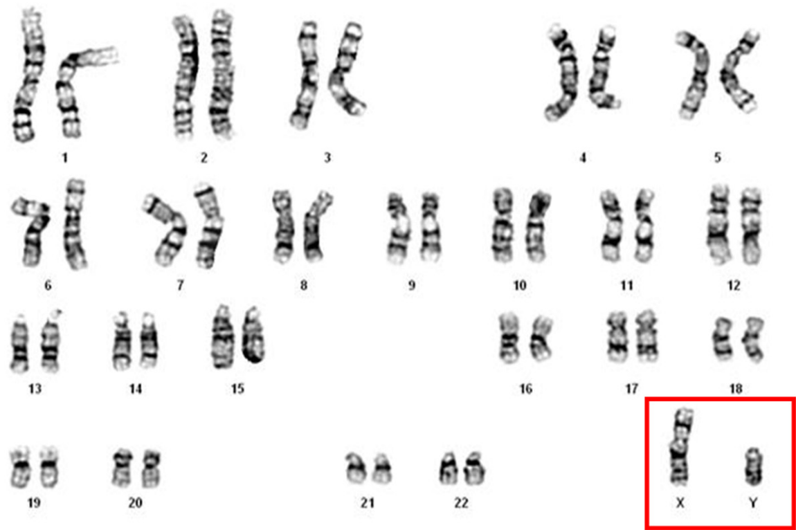
Figure 3. Cytogenetic study of cultured blood lymphocytes showed karyotype 46XY at 5 metaphases.

of genetic abnormality is the defect of the androgen receptor gene [10]. In CAIS, the