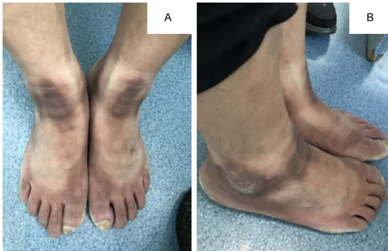
Figure 2. White and dark brown hyperkeratosis patches are scattered around both ankles, lateral edges of feet, and toenails (A, B).

keratosis that occurs after contact with water. At present, the name has not been unified, and it also is known as “aquagenic syringeal acrokeratoderma”, “aquagenic palmoplantar keratoderma” and so on. According to the literature [2-6], the disease is more common in young women, with the history of illness lasting from 1 week to 30 years. Most patients have no abnormal feeling after touching water, or only the local skin has a sense of tightness, while a few patients will get a burning or itching sensation. A few cases have a family history. In addition to the common locations such as palms and feet, some cases involved the nose, mouth, upper lip or double ankle joints and calves, and most of